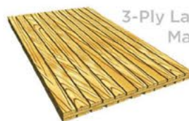
3-Ply Laminated Mat