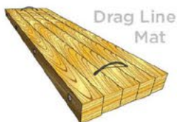
Drag Line Mat